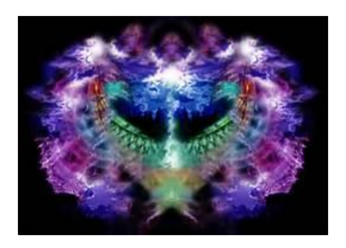
Shamanism Inside The World Of The Shaman

In various human societies these days, there exist some individuals who job is to supplement those religious practices of other people. These individuals also exist to guide people in such religious practices. These individuals are really skilled at influencing and contacting supernatural beings as well as manipulating some supernatural forces. Such individuals are called Shamans and they are actually practicing what is commonly called Shamanism. Get all the info you need here.