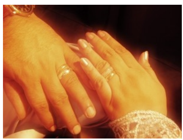
Chapter 6: Change Your Negative Mindset

A date night is the perfect moment for you to rediscover each other. This will surely spur a romantic spirit in the place where you intend to hold the date. If you have not yet tried to bond with your spouse due to your busy schedule at work, then now is the perfect time to start. By scheduling a date night once a week, your relationship will be healthier and stronger as the years go by. This is the secret to a happy married life. So, why don't you start planning now?