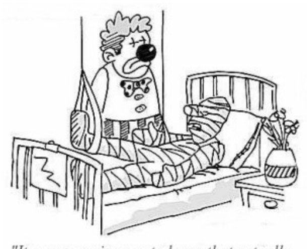
"It may surprise you to learn that actually, morphine is the best medicine!"

Most people use medicines or pills during a hangover. Aspirin and Ibuprofen may reduce headache and muscular pain, but they shouldn't be used if you're experiencing abdominal pain or nausea. These medicines are gastric irritants and can compound gastrointestinal hangover symptoms.