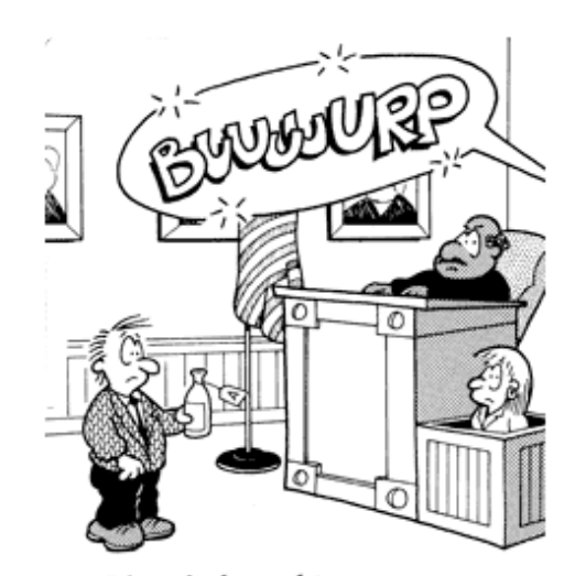
IN THE CASE OF SCHWEPPES VS. CANADA DRY, ANOTHER JUROR HAS TO BE EXCUSED...

If you're fed up of drinking plain water, you could always opt for a glass of flat ginger ale, since it helps to soothe your stomach.