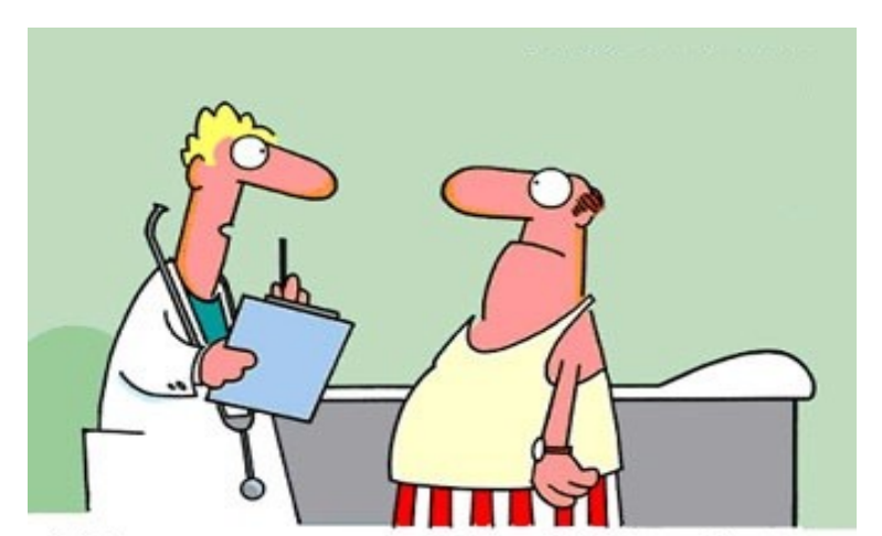
"Have you ever considered Gatorade as a substitute for pickle juice, Mr. Gristle?"

It's also said that professional athletes used to drink pickle juice before sports drinks like Gatorade were invented.