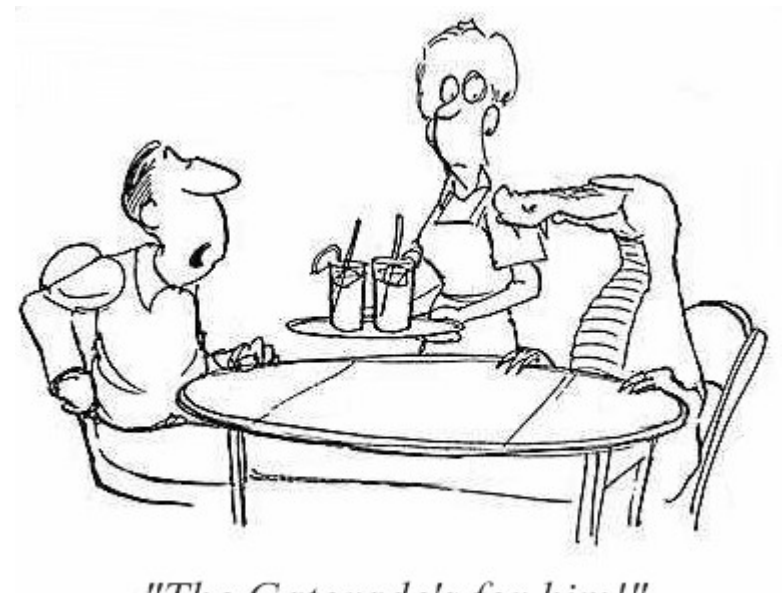
"The Gatorade's for him!"

Dehydration is the major side effect of alcohol intake. This causes some of the most common symptoms associated with hangovers - like headache, dizziness and lightheadedness. The quickest, easiest <u>and cheapest</u> way to relieve these symptoms, is to drink lots and lots of water.