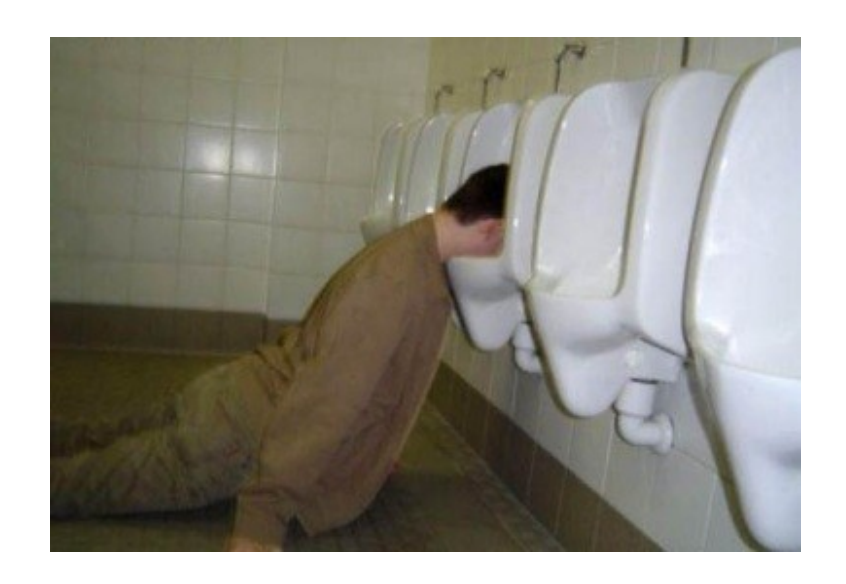
It Really Is The End!