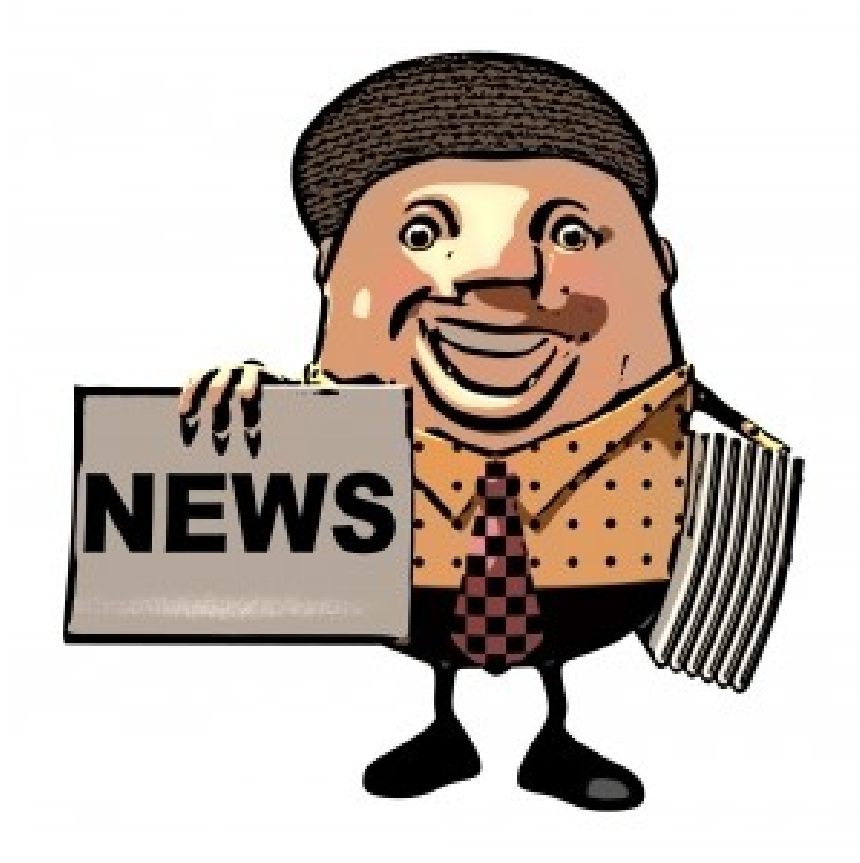
Using Banner Ads For Traffic

All types of advertising is beneficial to online and offline businesses. However choosing the type of advertising that is most suitable would give it the edge the campaign needs to take it to the next level. Banner ads will do that.