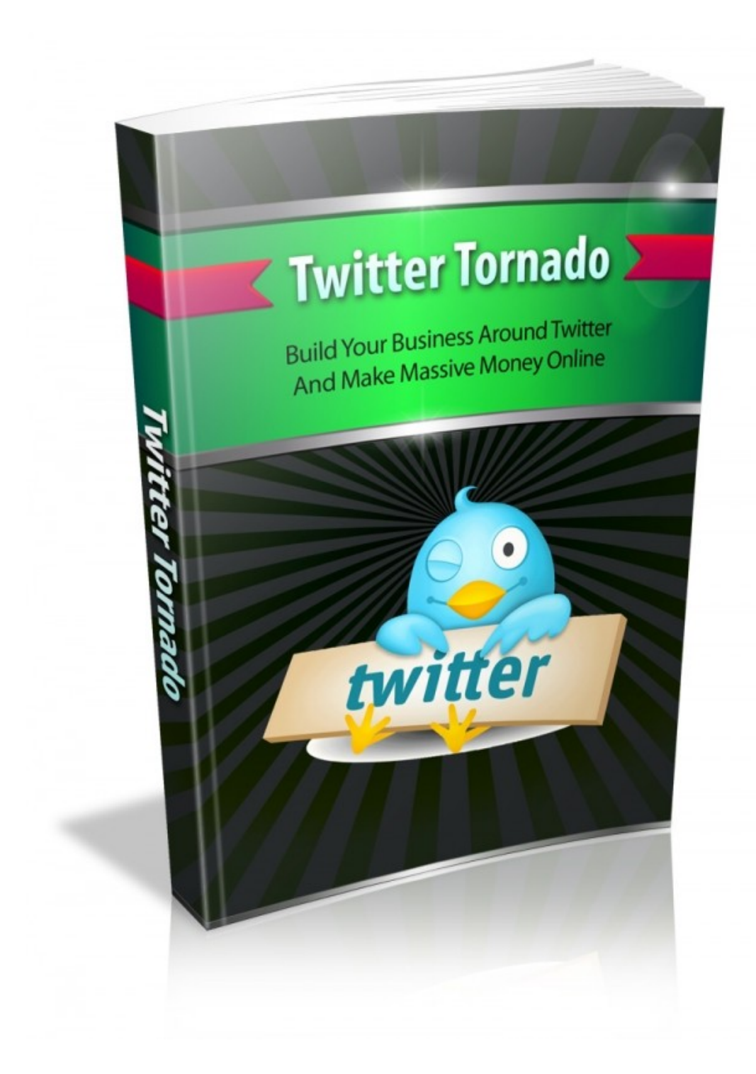
Brought to You By <u>Free-Books-Canada.com</u> You may give away this ebook.